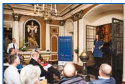
STILL.the vigil March 2018 – September 2019

JAN FEB MAR APR MAY JUN JUL AUG SEPT OCT NOV DEC