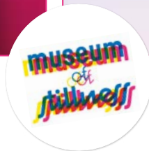
MUSEUM of stillness August – September 2019