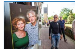
STILL.the stroll September 2018 – April 2019