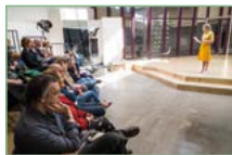
STILL.the stories February 2017 to 2020