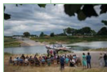
STILL.the tour July 2017 / April 2018