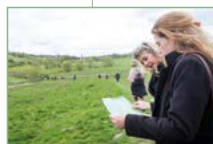
STILL.the walk April