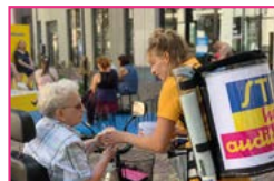
STILL.the auditorium August 2019 – 2020