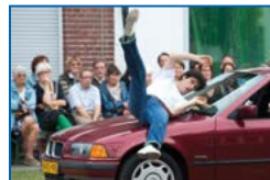
STILL.the dance August