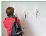
STILL.the lab January