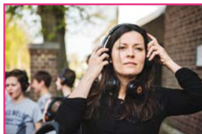
STILL.the podcast July 2019 – 2020