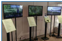
STILL.the portraits March