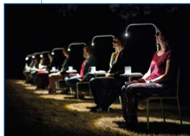
STILL.THE SCULPTURE GARDEN August