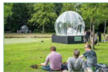
STILL.the pavilion June 2017 to 2020