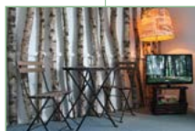
STILL.the suite January – December