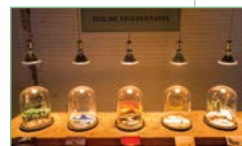
STILL.the table with the bell jars September 2017 – 2020