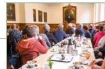
STILL.the film December