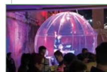
STILL.the disco August 2017 – 2020