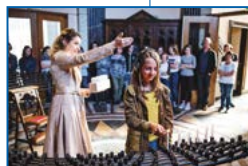
STILL.the guided tour May